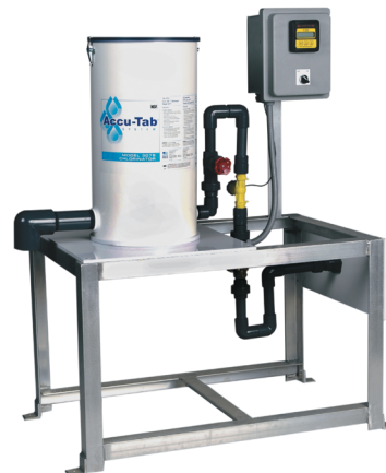
PowerPro Gravity chlorination unit using Accu-Tab chlorinator model 3075 with digital flow meter as shown.