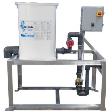
PowerPro MD chlorination unit using Accu-Tab chlorinator model 3150 as shown.