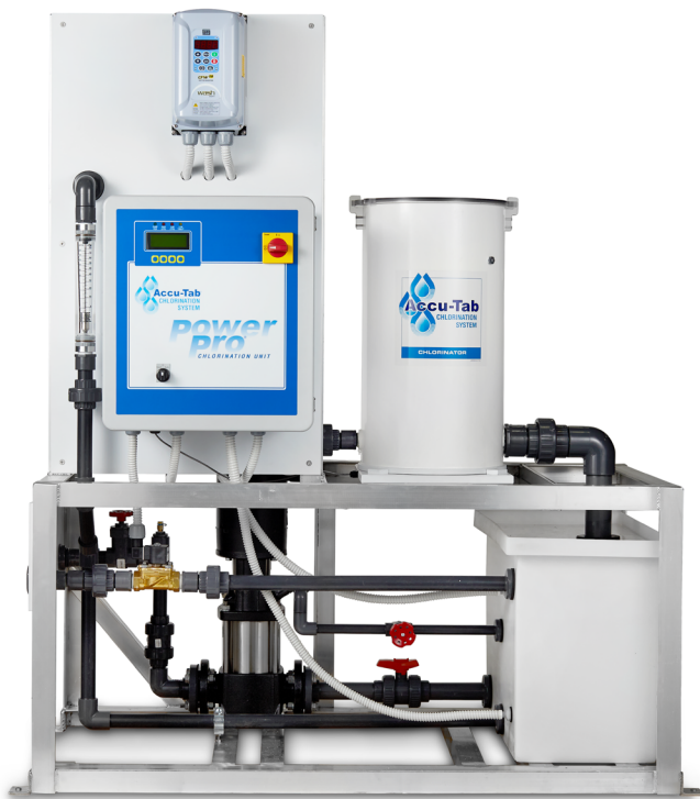
Accu-Tab system PowerPro 3075 chlorination unit shown with automated controller and weigh scale options.

PowerPro units are available in both gravity and pressure return models. They feature a simple "hook-up/plug-in" installation that expedites conversion from your old system. PowerPro units can be easily customized to meet your individual requirements and the compact size makes installation easy.